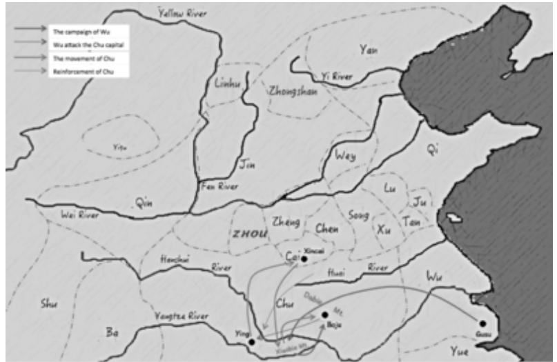
Situation during the Battle of Boju

of surviving Warring States military theory. Sun Bin's treatise is the only known military text surviving from the Warring States period discovered in the twentieth century and bears the closest similarity to The Art of War of all surviving texts.