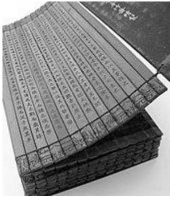
A copy of The Art of War written on bamboo

of surviving Warring States military theory. Sun Bin's treatise is the only known military text surviving from the Warring States period discovered in the twentieth century and bears the closest similarity to The Art of War of all surviving texts.