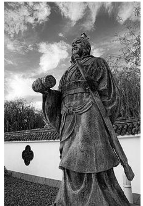
Statue of Sun Tzu in Yurihama , Tottori , in Japan

America's conflicts in East and Southeast Asia against Japan, North Korea, and North Vietnam brought Sun Tzu to the attention of American military leaders. The Department of the Army in the United States, through its Command and General Staff College , has directed all units to maintain libraries within their respective headquarters for the continuing education of personnel in the art of war. The